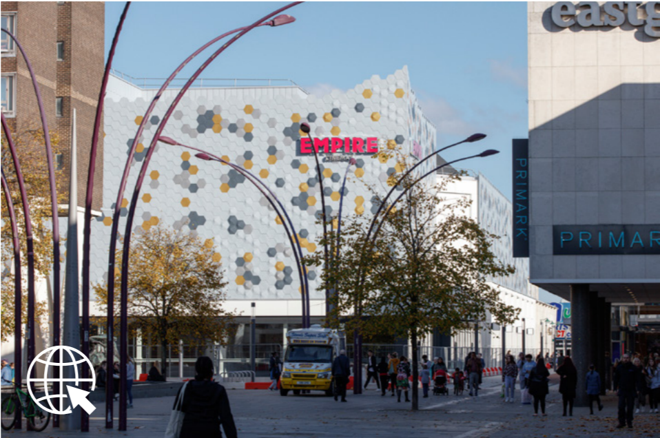
East Square Cinema Basildon