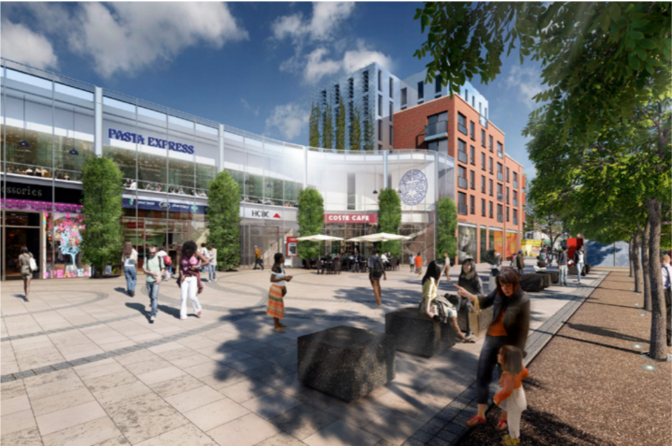
Wards Corner Haringey