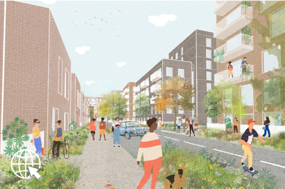
Hayes Town Centre Hillingdon