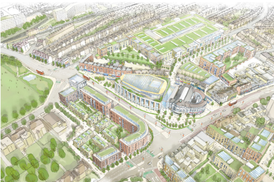
Catford Town Centre Lewisham