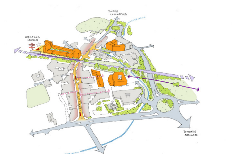
Wickford Town Centre Basildon