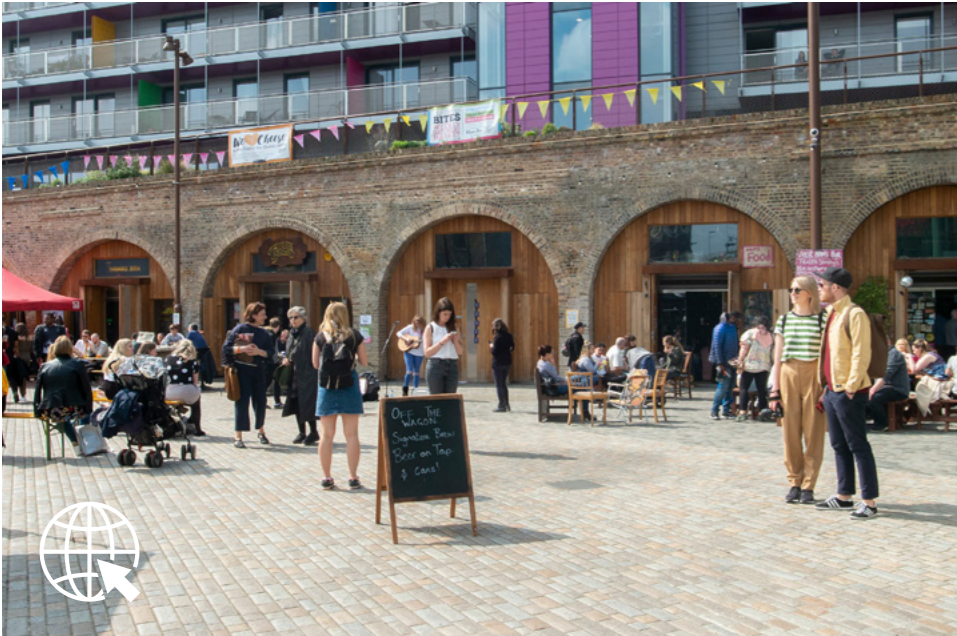
Deptford Market Yard Lewisham