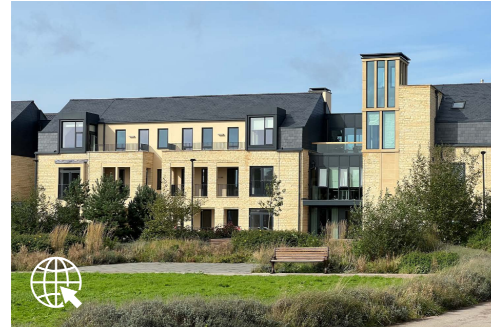
Pemberley Place Bath