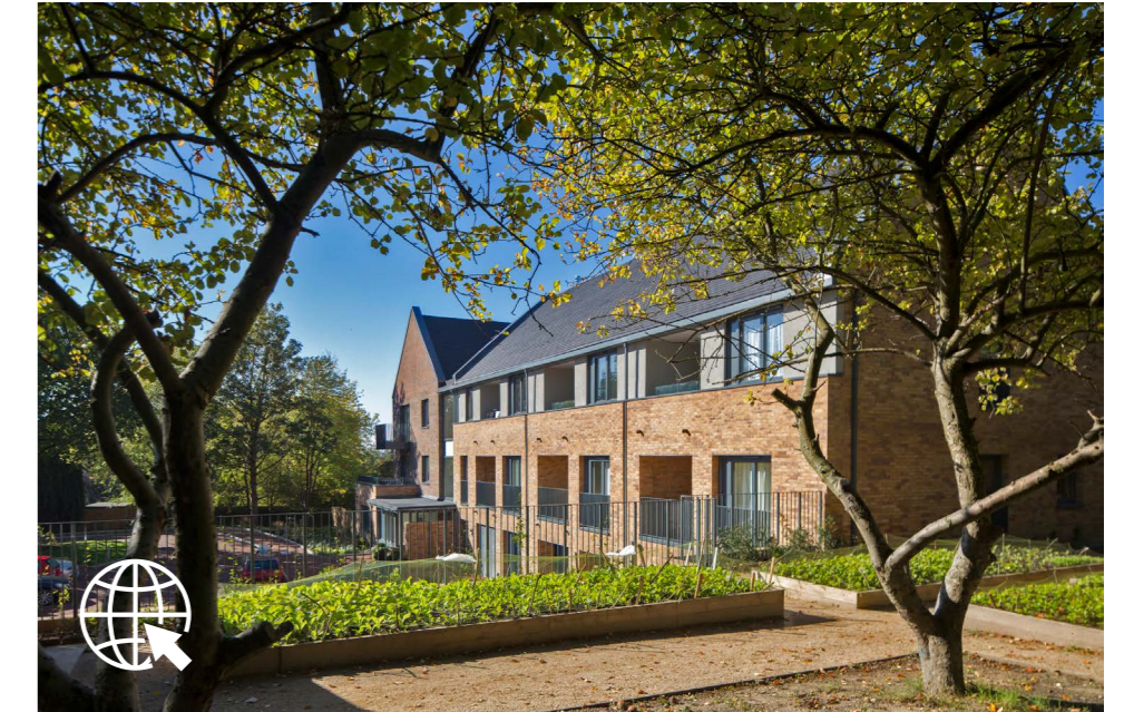
Centenary Lodge Aldershot