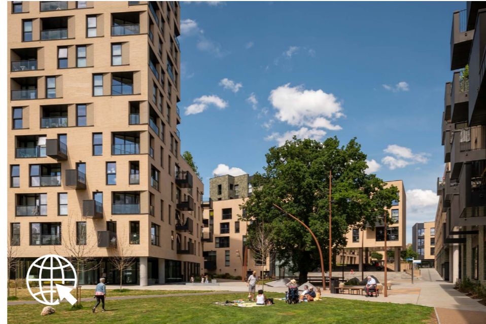
City Park West Chelmsford