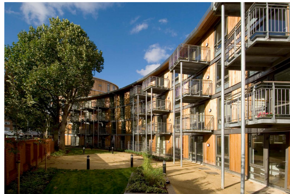
Lingham Court Lambeth