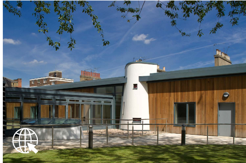
Ellesmere House Kensington